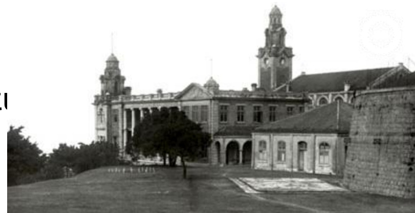
The main building of HKU in 1912 after it has just been finished constructing

We can learn about the architectural style at that time and things about the wars.