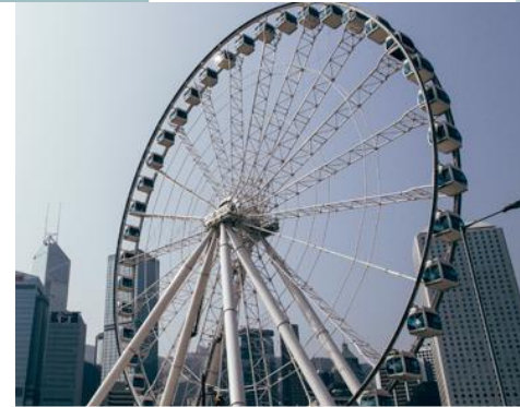
The outlook of the Ferris Wheel during the day with the LED lights off