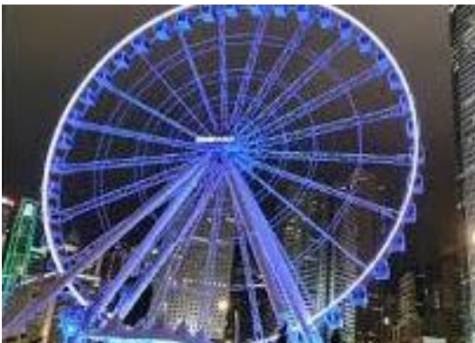
The outlook of the Ferris Wheel at the night, note the LED lights on the support frames and the monitor in the center

Its feature is the lights at night. It has installed LED lights on the support frames and there is a monitor on both sides of the Ferris Wheel showing images and advertisements electrical images on the Ferris Wheel. So that's why there are much more people going there at night.