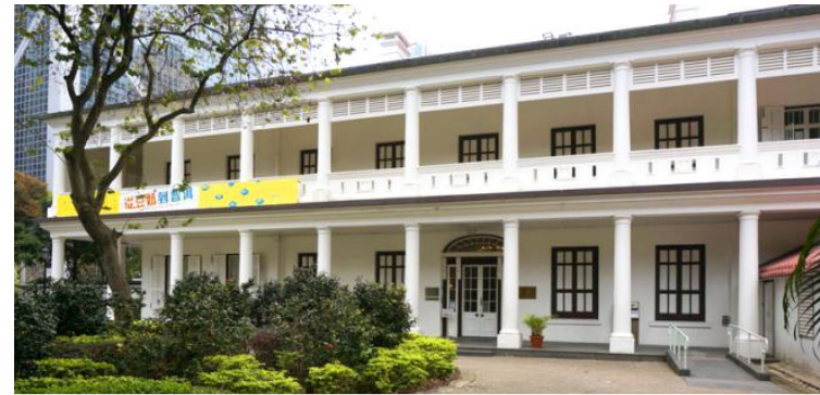
The outlook of the Flagstaff House Museum of Tea Ware

Visitors can know about the building style during the colonial period and know about the condition of living environment of the Foreigners compared to the local Chinese.