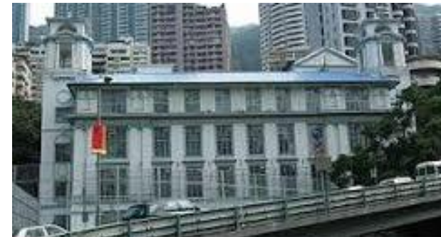
The west block of the college

We can know about the educational status of the local Chinese as the schools were built in the mid-levels where the foreigners live and which means Chinese people couldn't receive education during the colonial period.