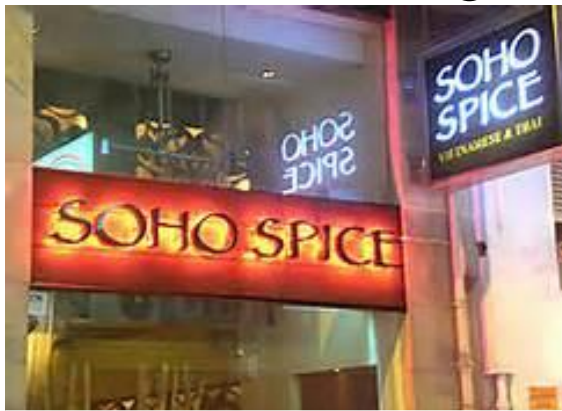
A restaurant called "SOHO SPICE"