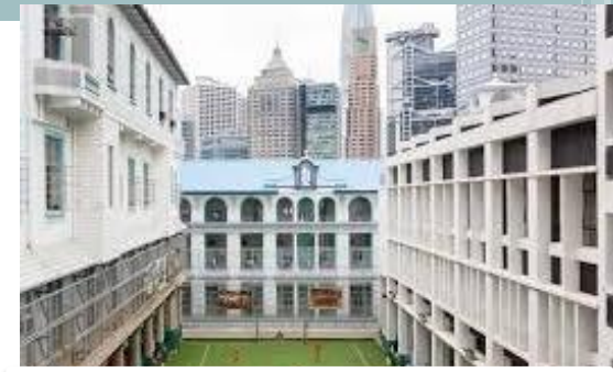
The inside of the college