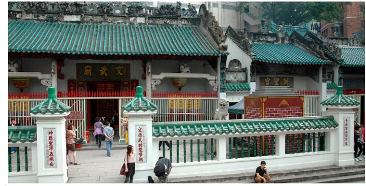
The outlook of Man Mo Temple

Tourists are able to taste the traditional Chinese religious culture in this old temple. The decorations, engravings, drawings on the walls are rich in history and culture, and worth-seeing.