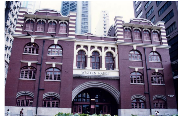
The front view of the western market

Nowadays, western market becomes a famous local tourist attraction in Hong Kong with record-high leasing revenues as well as move-in of household names in the market. It is a good place to go for shopping.