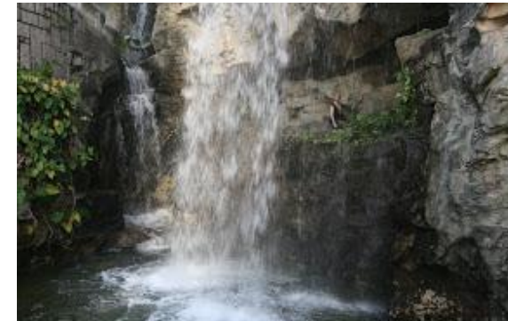
The artificial waterfall