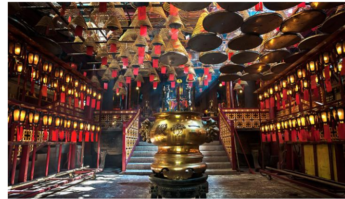
The inside of this temple. You can see the famous giant incense coils hanging from the ceiling. This is one of the unique characteristics of this temple.