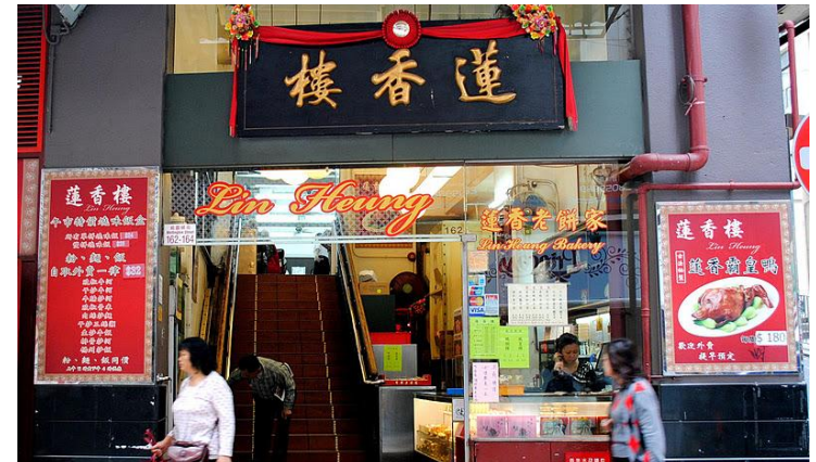
The front view of Lin Heung Tea House

Tourists can come and taste the local and traditional Chinese cuisines.