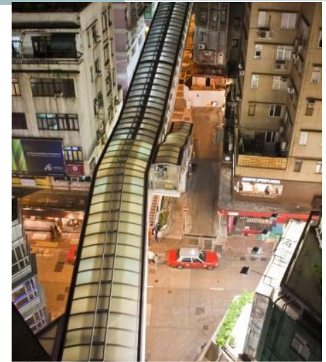
The world's longest outdoor escalator from the bird's view

Visitors can entertain themselves here. They can go to the bars and clubs and different restaurants to have local and overseas cuisines. They can also try going up and down the district by the world longest outdoor escalator!