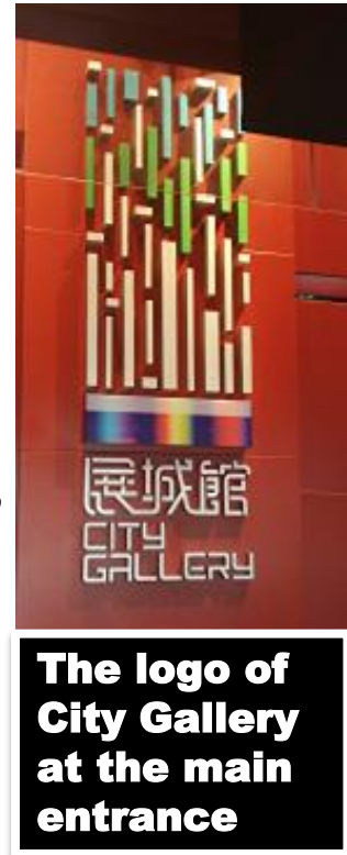
The logo of City Gallery at the main entrance

It shows Hong Kong's major planning proposals and infrastructure projects and also shows us our city's future development look. Tourists can know more about Hong Kong's history and its future developments.